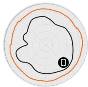
Figure 4. R750 2.4GHz Elevation Antenna Patterns

Figure 3. R750 5GHz AzimuthAntenna Patterns