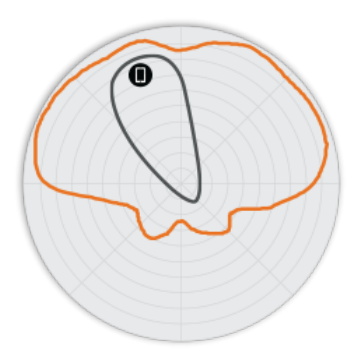
Figure 5. R750 5GHz Elevation Antenna Patterns

Figure 4. R750 2.4GHz Elevation Antenna Patterns